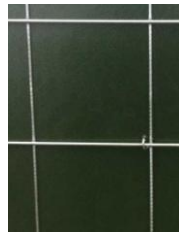
Backside- Coated plated and wirenetting