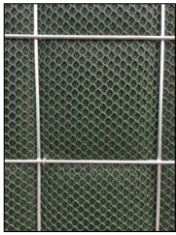
Noiseside- Absorbative PE netting and wirenetting